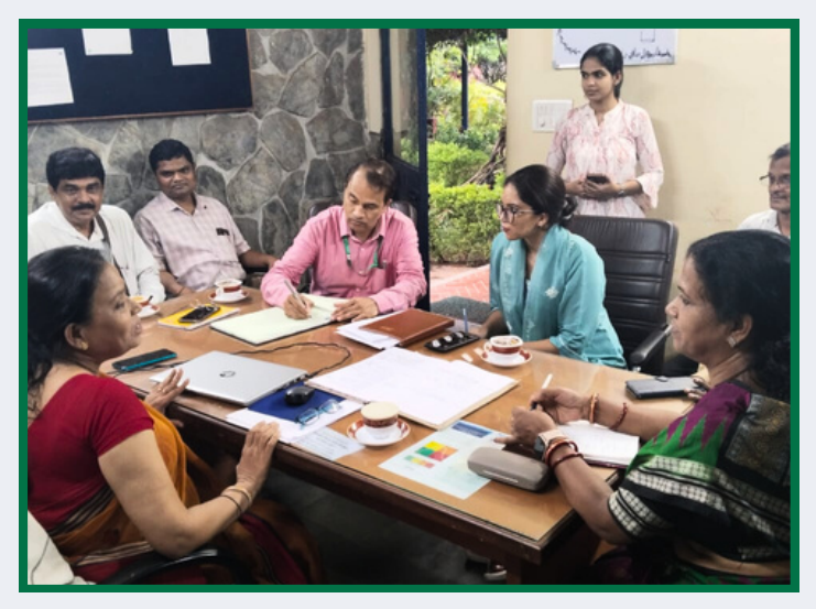
Odisha Visit: 5-6 July 2024